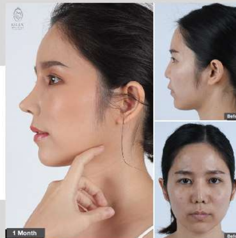
BEFORE & 1 Month